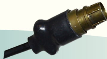
6 Pin Connector on a Charger